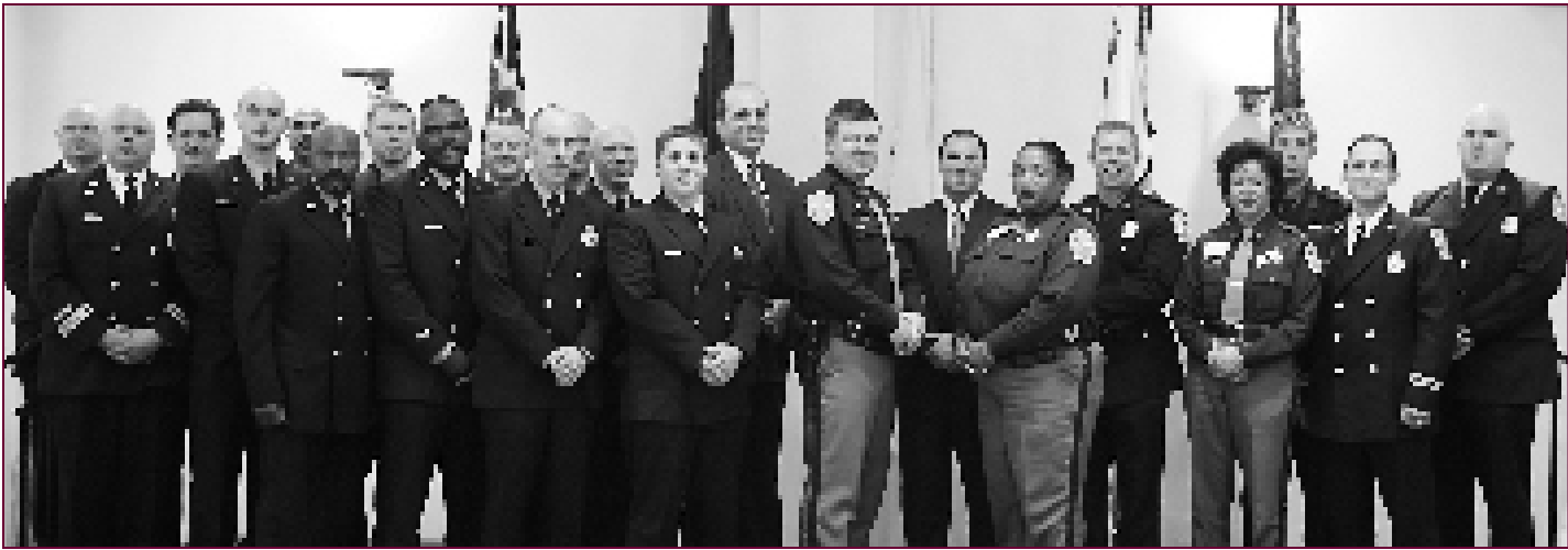
Congratulations to all 2005 Valor winners.