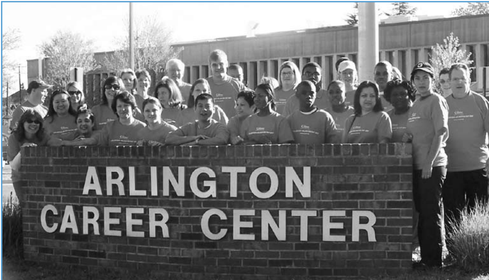
2007 Volunteer Arlington Day Volunteers