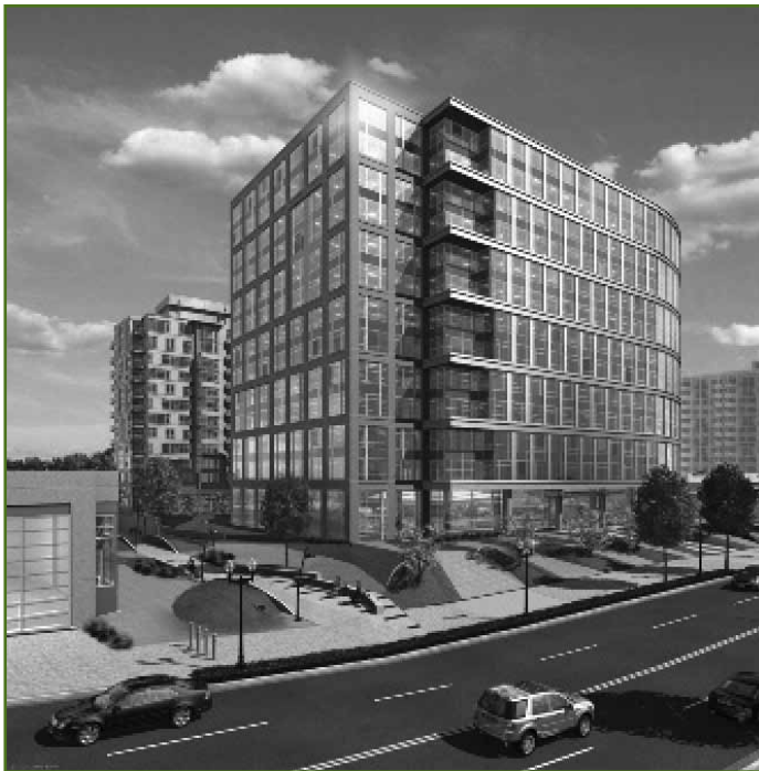
View looking north from North Randolph Street.